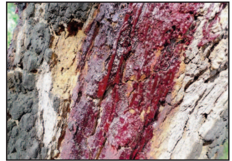
The bark on this tree has been disrupted by Wi-Fi frequencies.