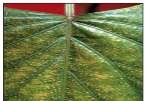
The damaged epidermis of this leaf gives an idea of the type of damage given by Wi-Fi radiation.