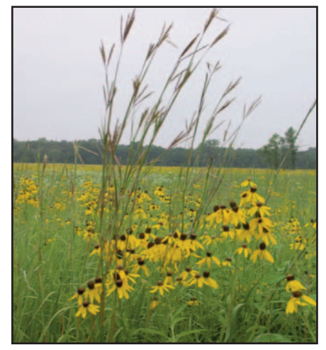
Big bluestem and yellow coneflowers are beautiful sentinels of the more humid eastern Great Plains. Bluestem can stand taller than a man!

Carolina poplar trees in a dense stand in combination with a grass seeding. "This approach clearly has been effective in