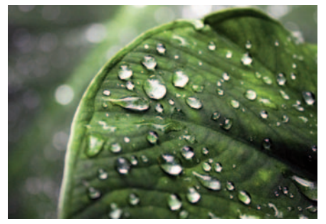
Nutrients are readily absorbed through the leaf surfaces of plants.

University,<sup>1</sup> claim that field trials using nitrogen (N), phosphorus (P), or potassium (K) foliar fertilizers have not given benefits for either corn or soybeans in Iowa. Dr. Sawyer states that "Greater efficiency with a foliar nutrient application might be a theoretical advantage; however, research with various products has not shown this to occur." He claims that the main difficulty with applying N, P, and K via foliar sprays is the large amount of nutrient required, which cannot be achieved through sprays. For example, a 200 lb/acre N application for corn cannot be achieved through foliar sprays, primarily because of the number