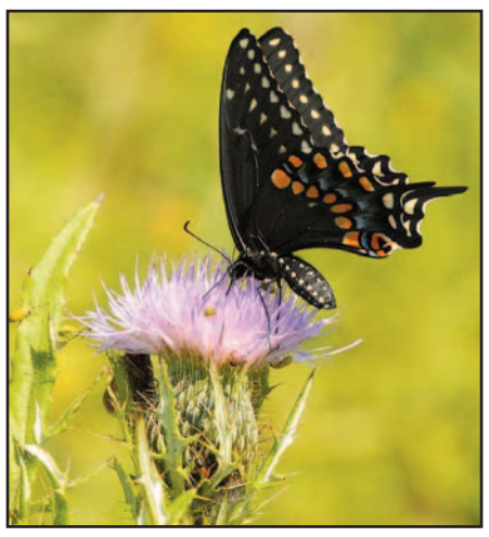
Prairie plants not only beautify the land, but attract beneficial animals and insects that help stabilize the ecosphere and recycle nutrients.

beginning its summer growth. "This combines grazing and cropping into a single land-use method where each one