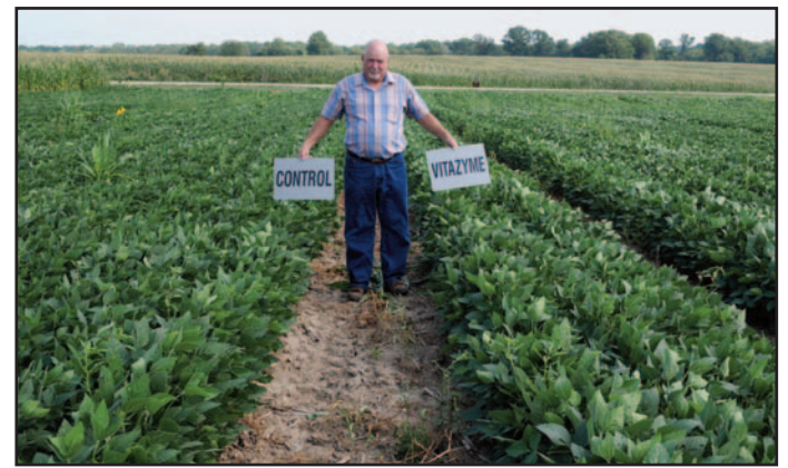
from the hail. University of Missouri. Vitazyme treatment (right) increased crop response substantially.

levels in tissues, meaning less pest stress. The corn had 20% fewer broken stalks from the hail.