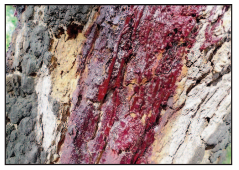
The bark on this tree has been dirupted by Wi-Fi frequencies.

trees and plants by supplying a proper balance of nutrients and growth promoters. Organic sources are often the