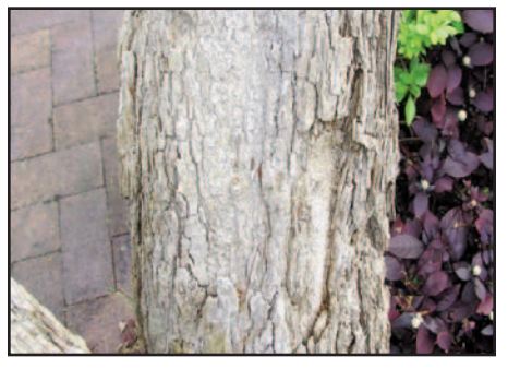
A young tree affected by Wi-Fi frequencies looks rough and aged.

best. Use only the best soil mixes, and build and maintain excellent porosity for good air and water movement in the root zone. Water adequately but not excessively. A healthy plant can resist the ravages of dangerous electromagnetic radiation much better than a stressed plant.